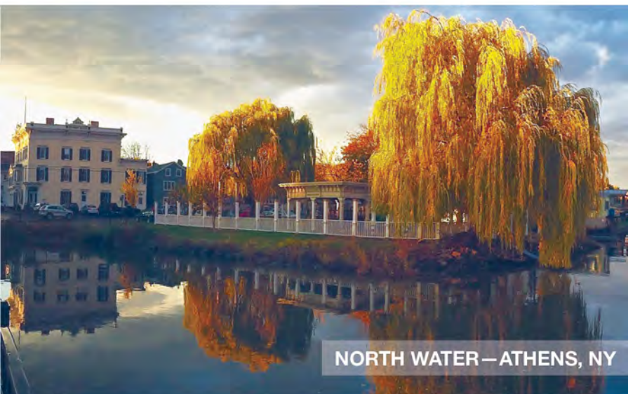
NORTH WATER — ATHENS, NY

Principal is returned in full to you after your short 1-year term.